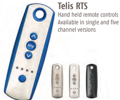
Telis RTS Hand held remote controls Available in single and five channel versions

Radio Technology Somfy (RTS) offers a high-performance, convenient and reliable solution, eliminating the need for wiring between the motor and controls. With the radio receiver integrated within the motor, RTS is the ideal choice because installation is quick and easy. The Sunea™ RTS CMO is compatible with Somfy's entire range of controls including hand-held remotes, wall switches, timers, sensors and outdoor heater.