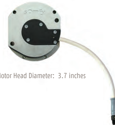
Motor Head Diameter: 3.7 inches