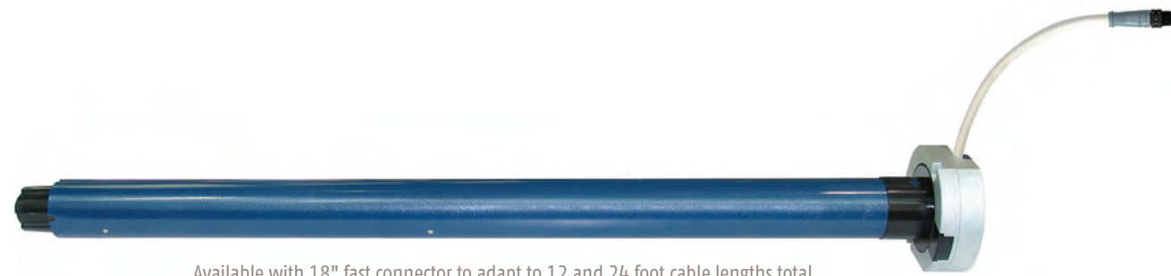
Available with 18" fast connector to adapt to 12 and 24 foot cable lengths total

Maintain control of the awning even with the loss of power. This dependable function enables the user to have peace of mind and operate the awning with a crank handle should power be lost. Additionally, Somfy's advanced technology ensures that all settings and programmed controls remain in the motor's memory.