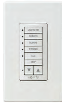
DecoFlex WireFree™ RTS Wall Switches Available in 1, 2, 3, 4 and 5 channel versions

Also available in: Ivory Finish and Black Finish