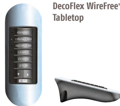
DecoFlex WireFree™ Tabletop

Also available in: Ivory Finish and Black Finish