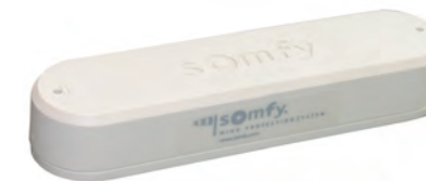
Eolis WireFree™ RTS Wind Sensor

Also available in: Off-white Finish and Black Finish