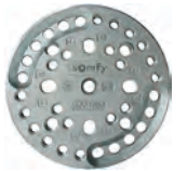
Sunea™ RTS CMO Universal Bracket